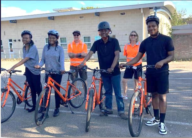
Adult cycle training