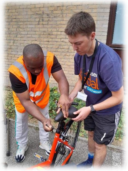
Bike fixing training