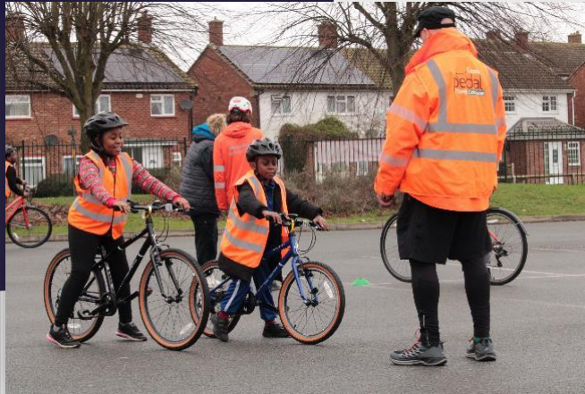
Children cycle training